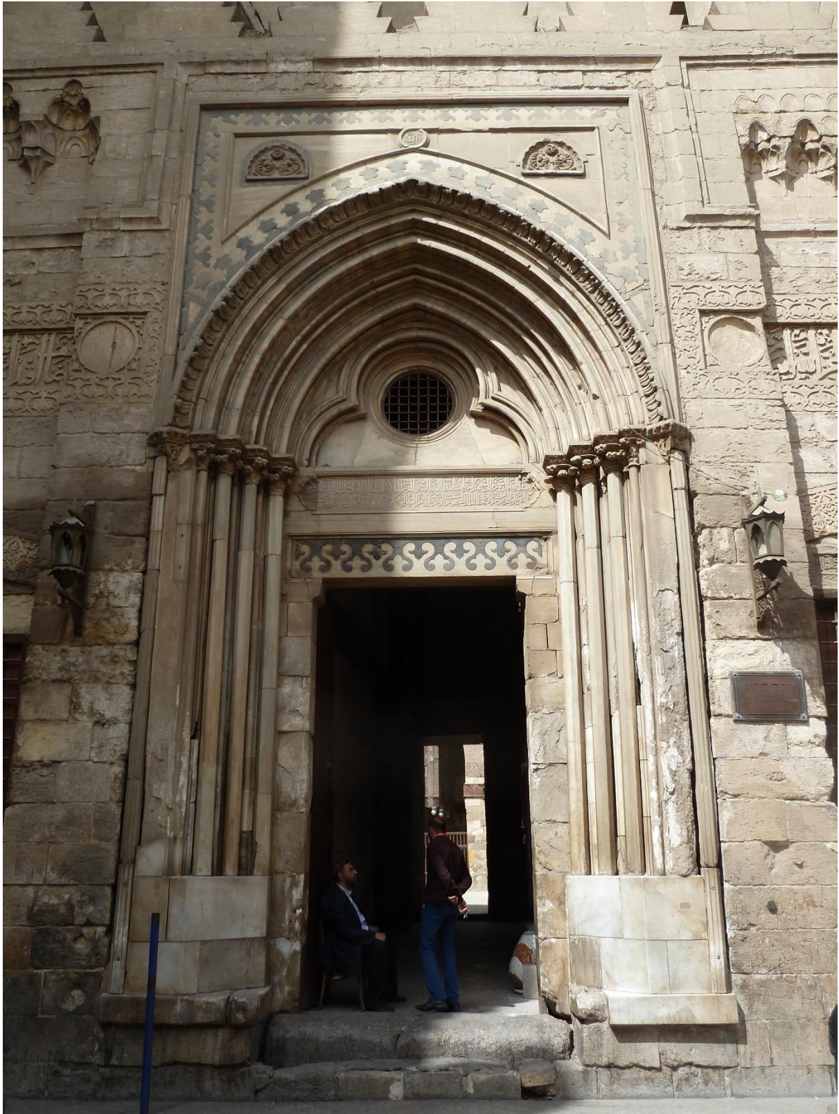
Fig. 13: Madrasa of al-Nāṣir Muḥammad, Gothic portal