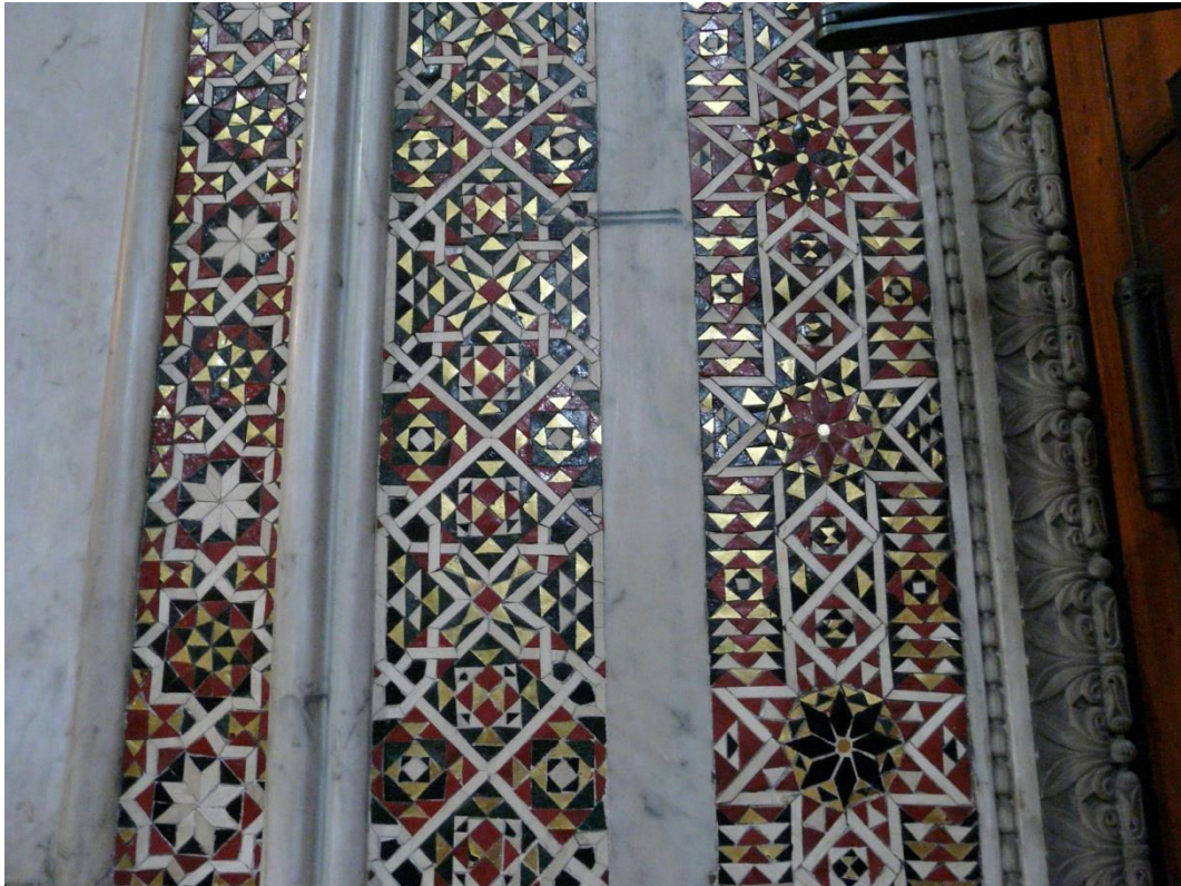
Fig. 5: Cappella Palatina, decorative panel