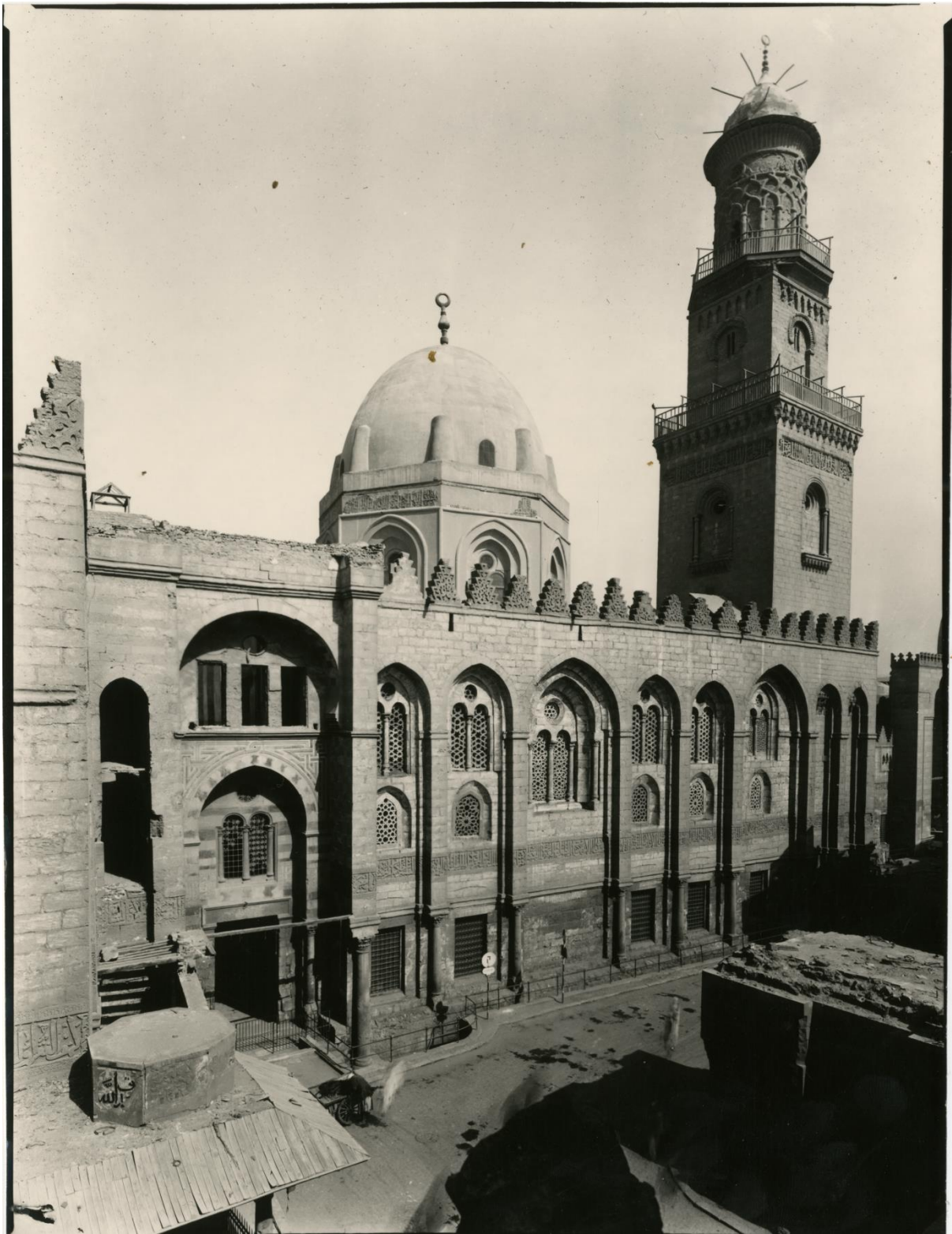
Fig. 1: Complex of Qalawun, exterior