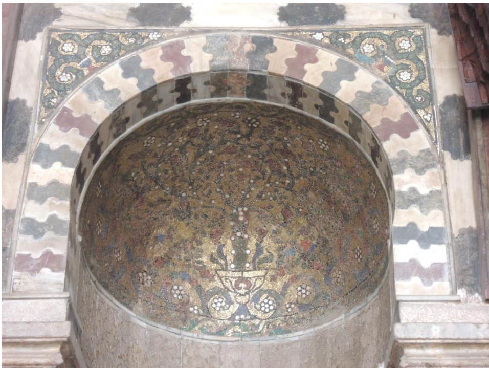
Fig. 6: Qalawun's madrasa , glass mosaics in the mihrab