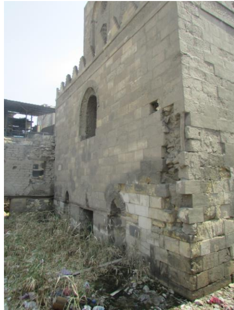
Fig. 8: Mausoleum of al-Ashraf Khalil exterior