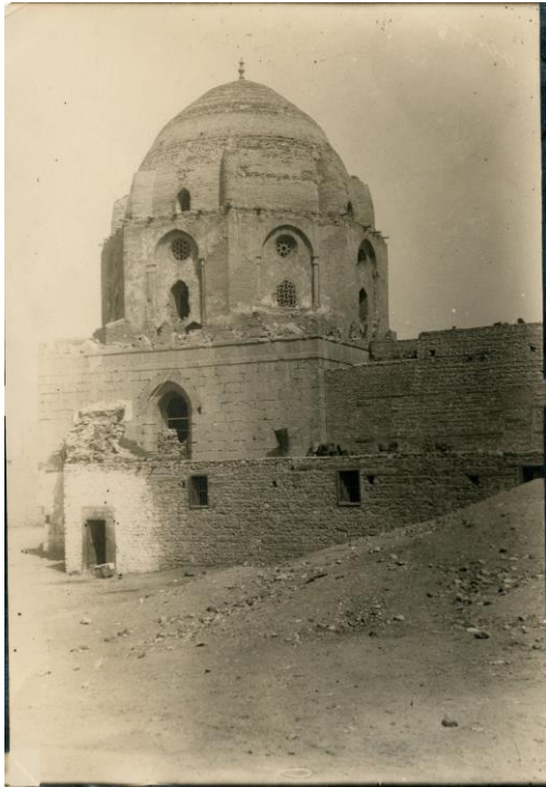
Fig. 7: Mausoleum of al-Ashraf Khalil, exterior