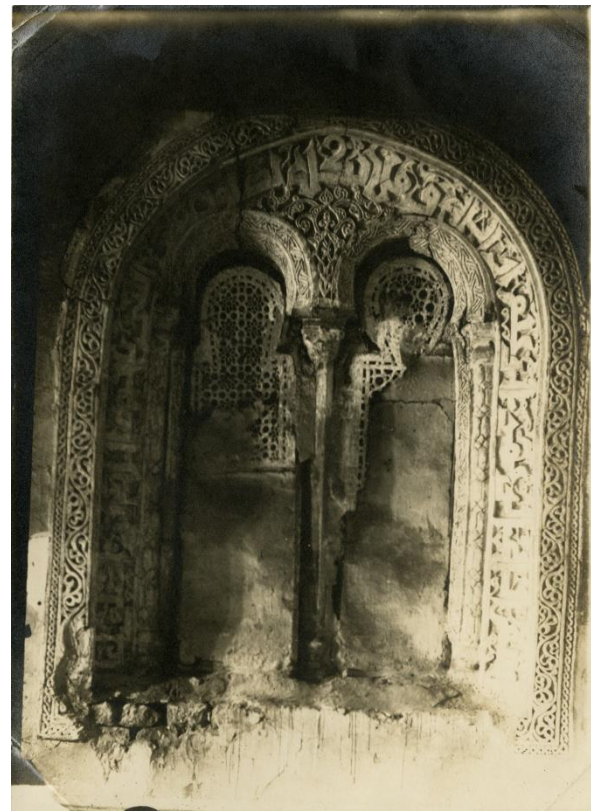
Fig. 10: Complex of Qalāwūn, window