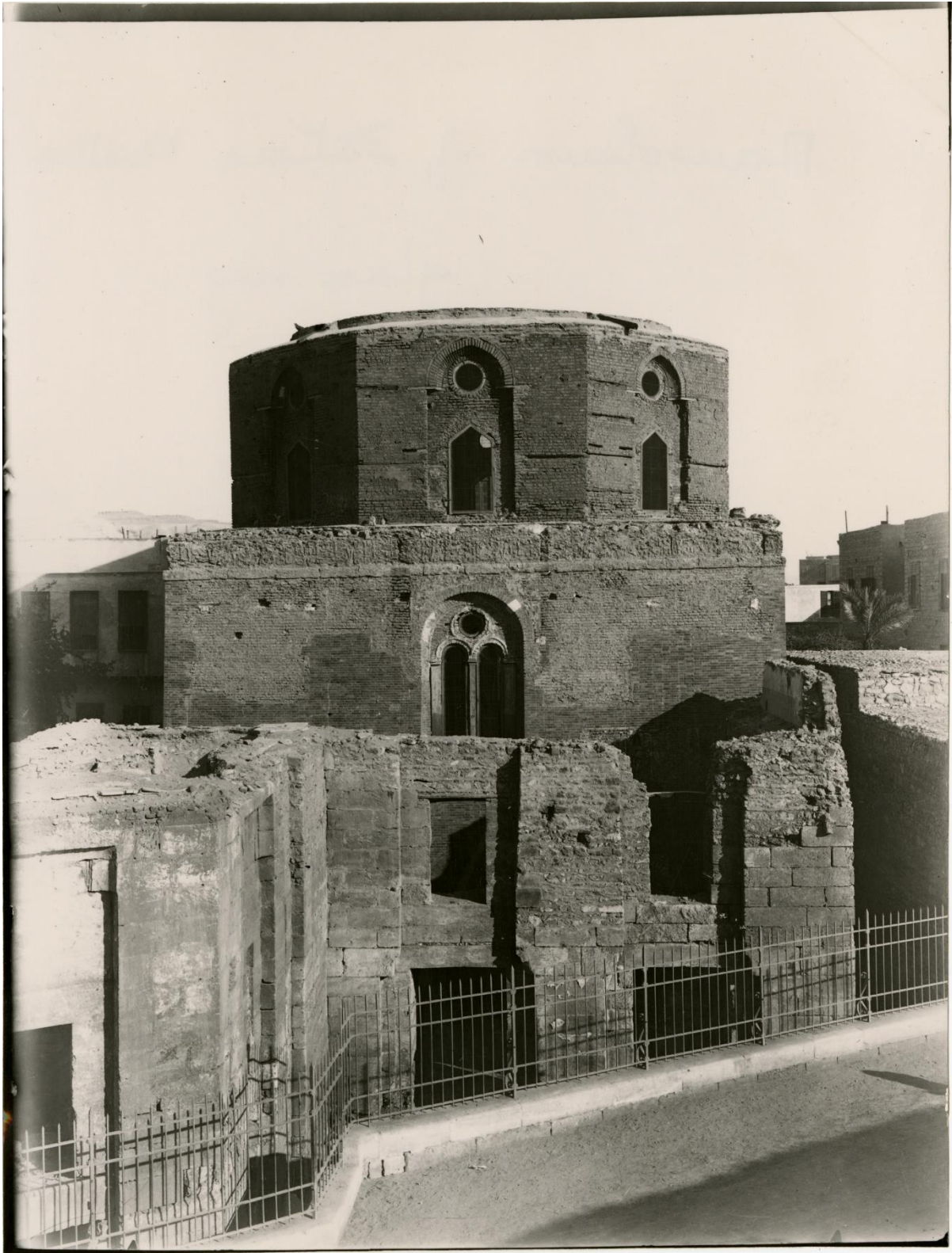
Fig. 2: Mausoleum of Fāṭima Khātūn, exterior