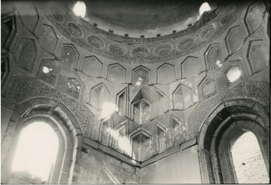
Fig. 11: Mausoleum of al-Ashraf Khalīl, zone of transition