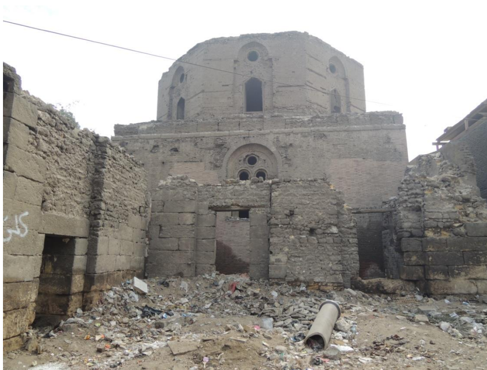
Fig. 3: Mausoleum of Fāṭima Khātūn, exterior