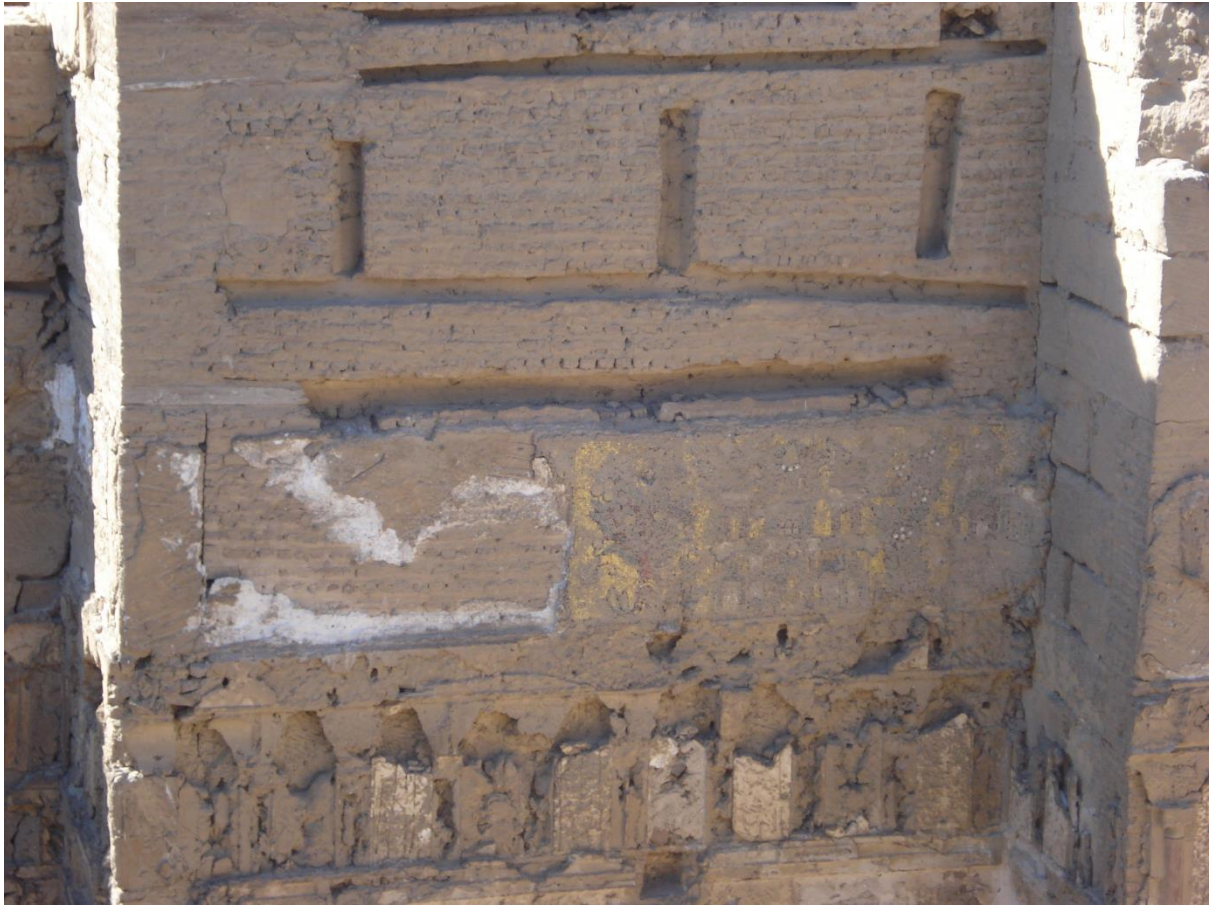
Fig. 14: Al-Qā'a al-Ashrafiyya, glass mosaic band in southwest wall