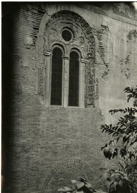
Fig. 9: Mausoleum of Fāṭima Khātūn, window