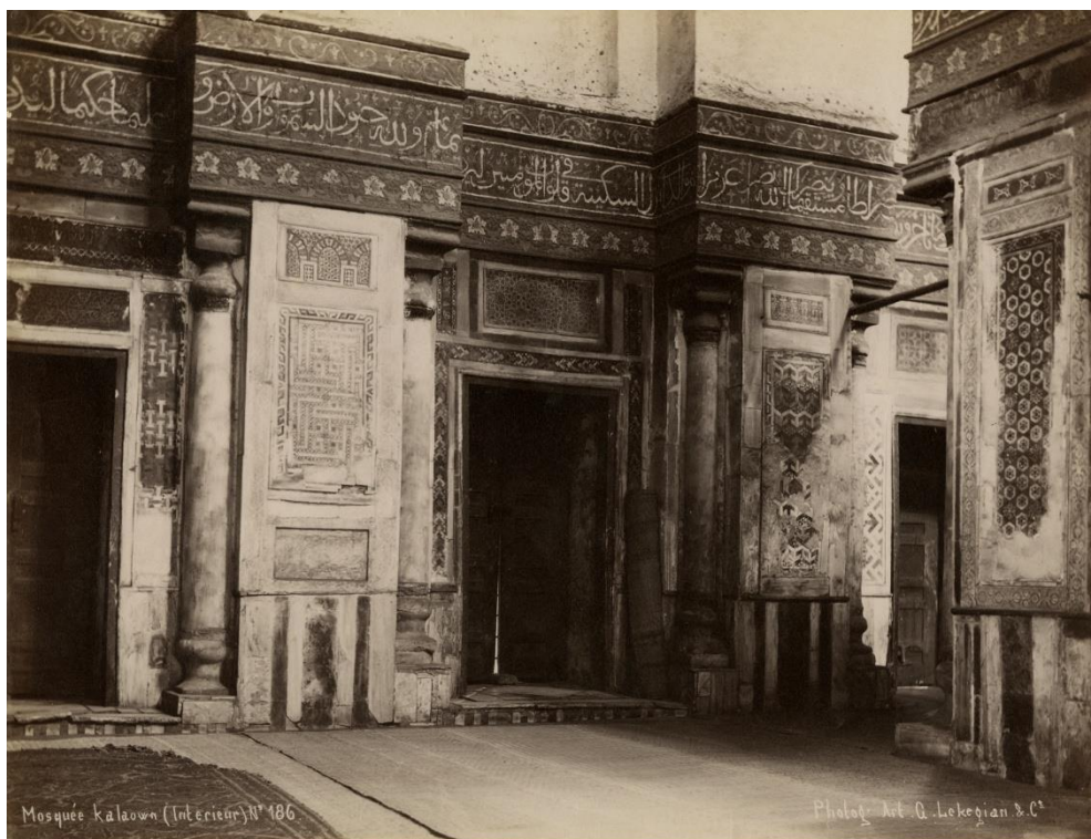
Fig. 4: Complex of Qalāwūn, interior of mausoleum